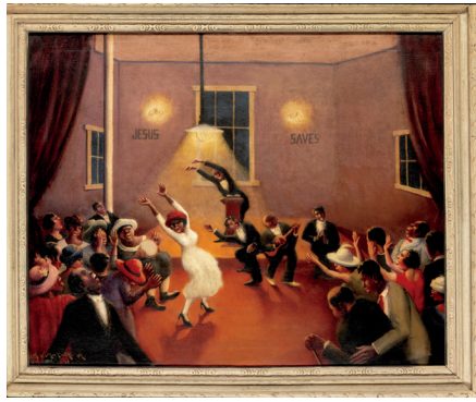
Archibald J. Motley Jr., Tongues (Holy Rollers) , 1929. Oil on canvas, 29.25 x 36.125 inches (74.3 x 91.8 cm). Collection of Mara Motley, MD, and Valerie Gerrard Browne.